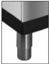
B-model bin leg